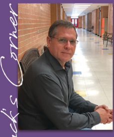
Final Thoughts from the Executive Director