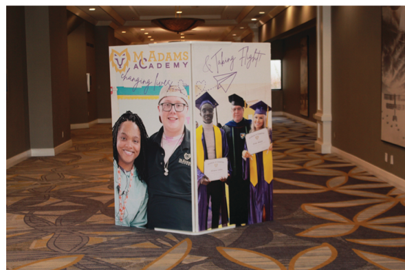
Our guests "walked the halls" of McAdams through our immersive exhibit