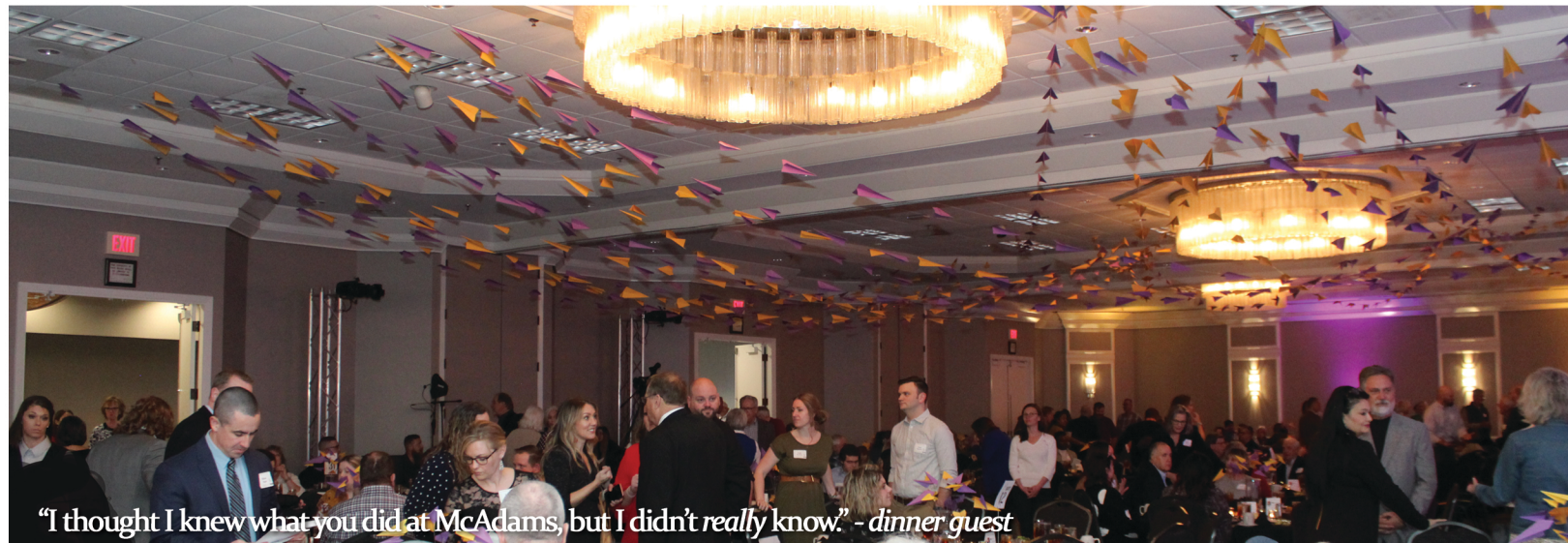
"I thought I knew what you did at McAdams, but I didn't really know." - dinner guest